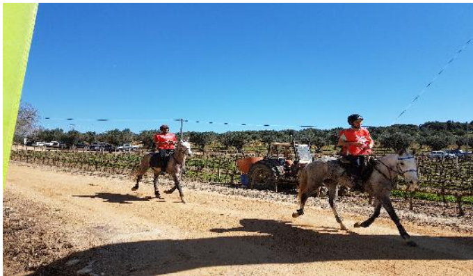
(*) Número de Fases acabou