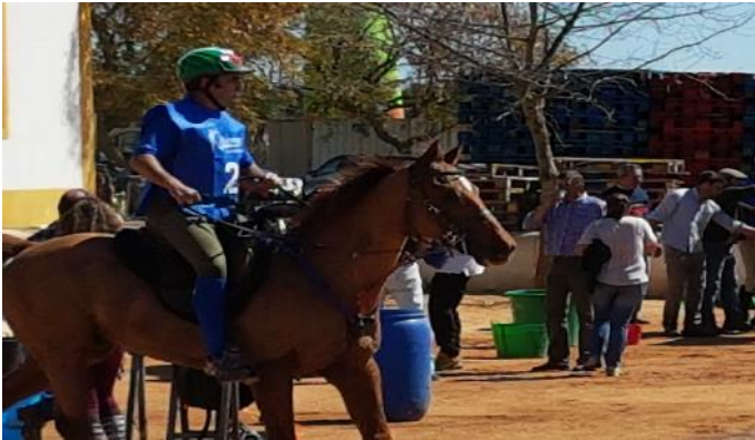
(*) Número de Fases acabou