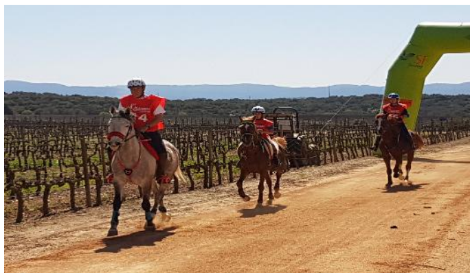
(*) Número de Fases acabou