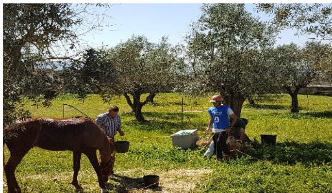
(*) Número de Fases acabou