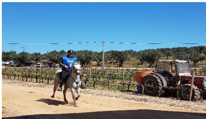
(* Número de Fases acabou