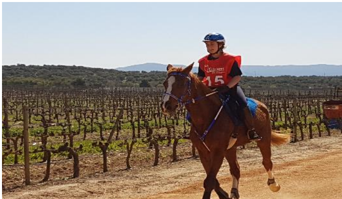
(*) Número de Fases acabou