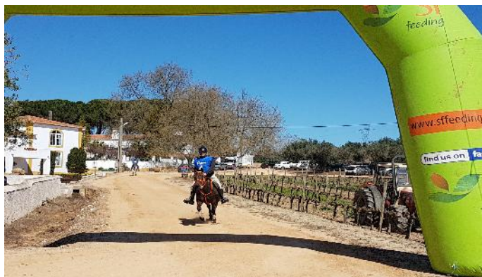
(*) Número de Fases acabou