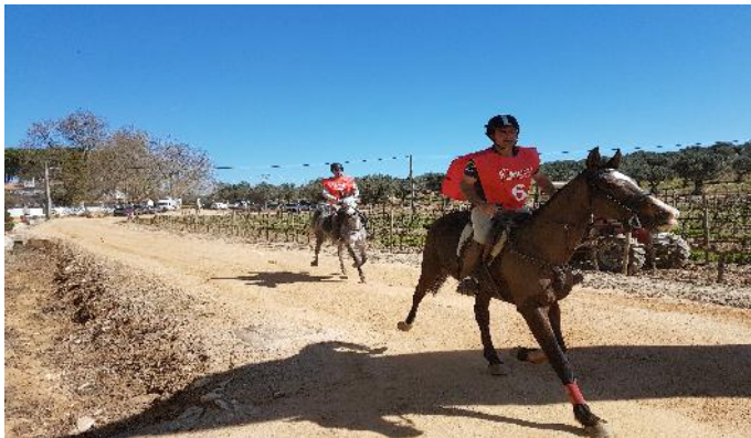
(*) Número de Fases acabou